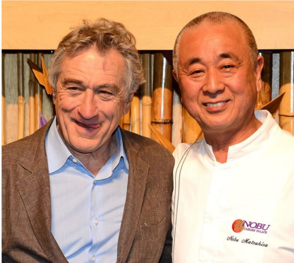
Actor Robert De Niro, left, and chef Nobu Matsuhisa attend the grand opening celebration of the world's first Nobu Hotel Restaurant and Lounge Caesars Palace on April 28, 2013 in Las Vegas, Nevada.